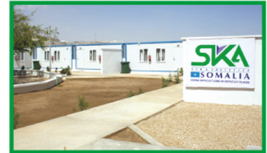
SKA Camp Le Roux