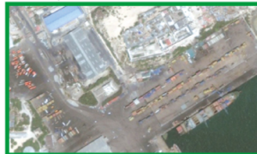
The Port of Mogadishu