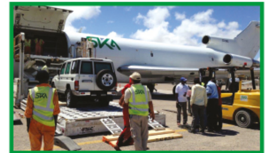
Aden Adde International Airport