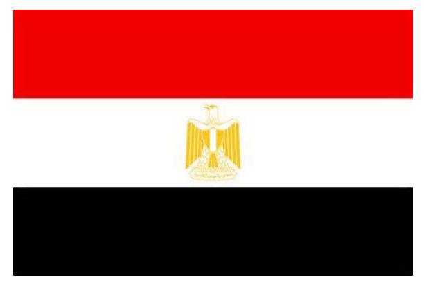
Egyptian Flag (https://www.cia.gov/library/publications/the-world-factbook/geos/eg.html)

1.9 The literacy rate for the population is 74% of the total.