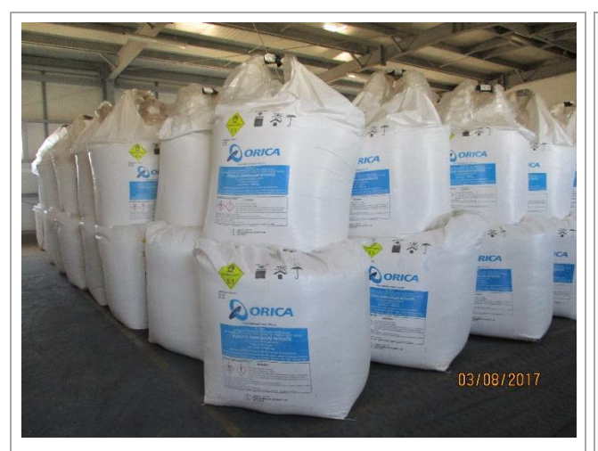
13. Photo of AN bags stacked in the warehouse.