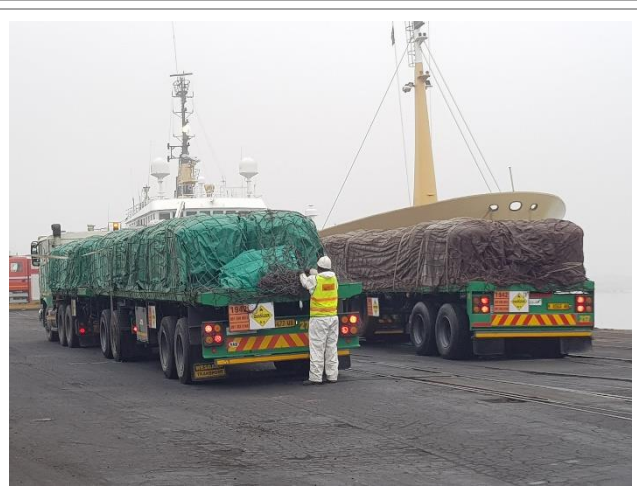
10. Loaded trucks covered with tarpaulin and secured with lashing prior to departure from the port.