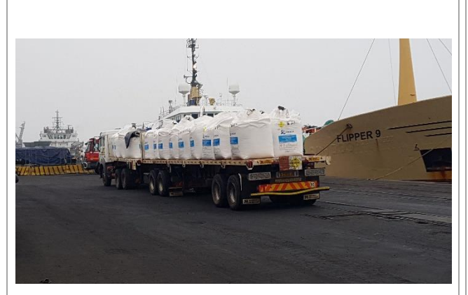
9. Example of a loaded truck.