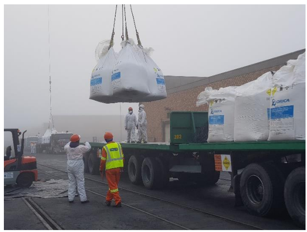
8. VTAS staff member supervising the loading of AN onto a truck.