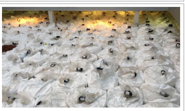
4. Ammonium Nitrate in one tonne sling bags inside of the Hold.