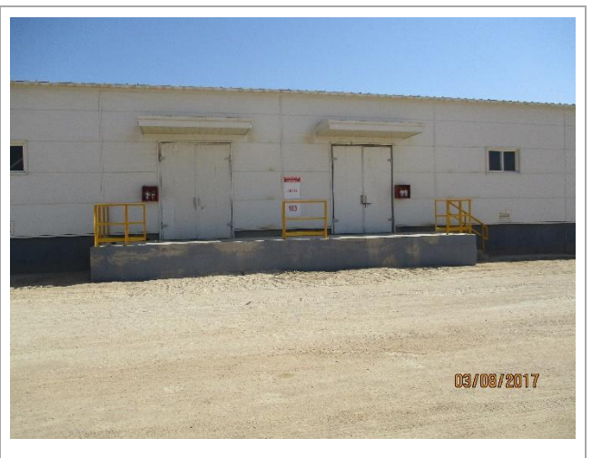
12. Warehouse used for the storage of AN.