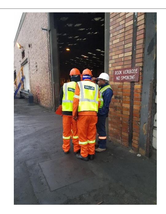
2. VTAS staff planning days discharge.