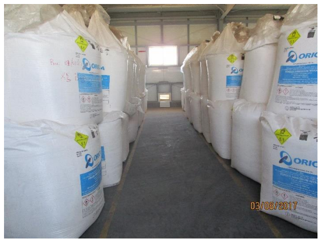
14. View of spacing between stacks within the warehouse.