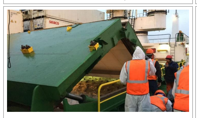
3. Hatches opening for the pre-discharge inspection of cargo.