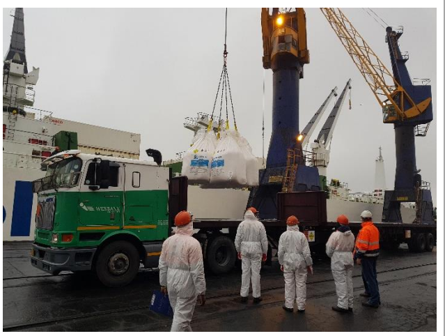
6. Shore cranes loading bags from a platform onto a truck.