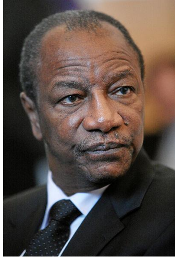
Alpha Condé – President of the Republic of Guinea (Ref: World Economic Forum)