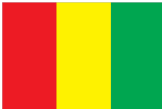
Guinea flag (Ref: CIA World Factbook).