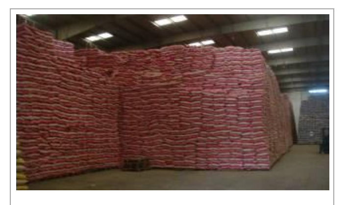
7. Immaculately stored rice