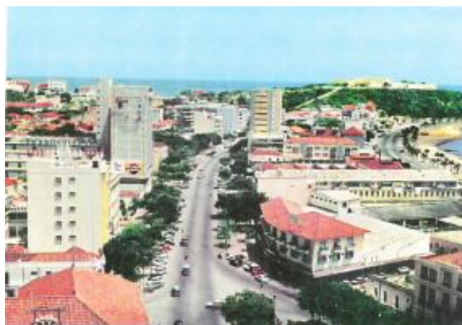
A photograph of Avenida Salvador Correia in central Luanda taken around 1967.