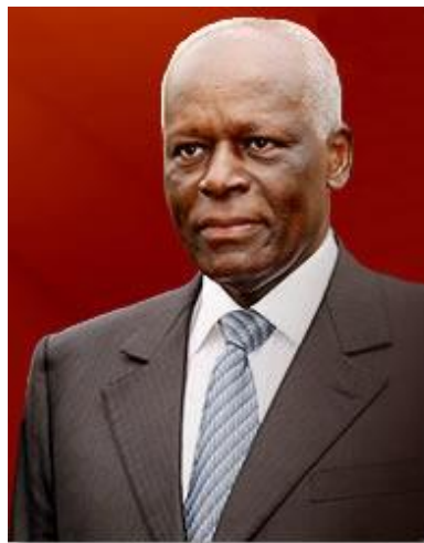
President José Eduardo dos Santos