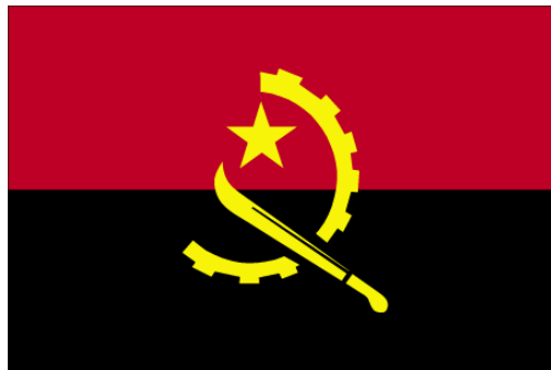
Angolan flag (Ref: CIA World Factbook).