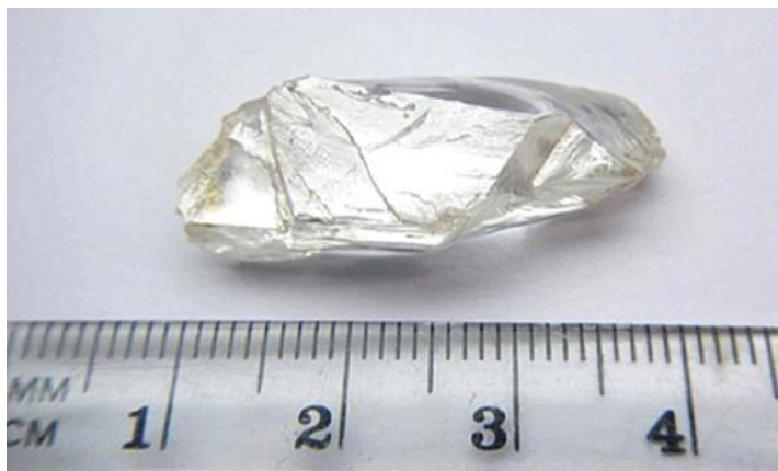
A 32.2 carat Type 2A diamond unearthed at the Lulo Concession mine in Angola in January 2014.