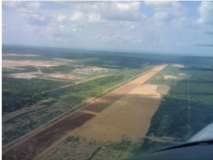
Aerial view of the airport construction site near Luanda, March 2009.