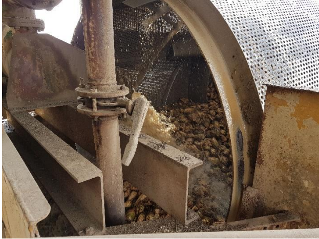
7. Inside washing drum.