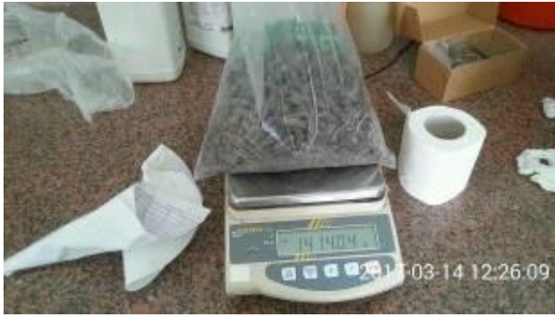
25. High accuracy lab scales.