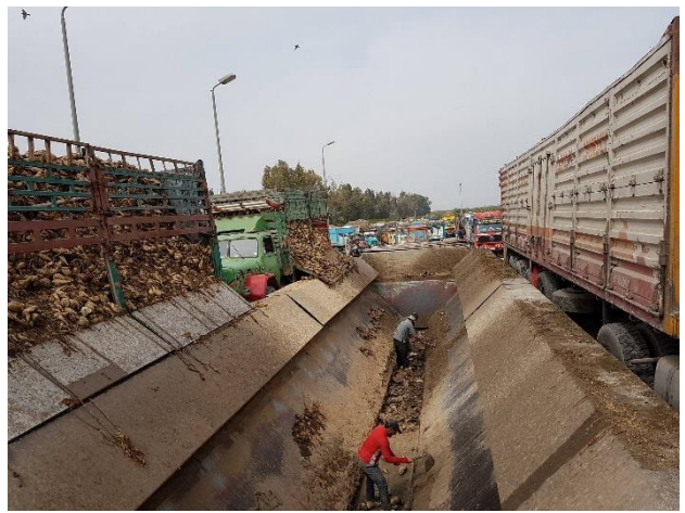
2. Truck release bay and conveyor mouth during cleaning.