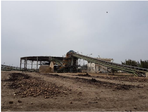
3. Sugar beet clearing and waste yard with conveyor from truck bay.