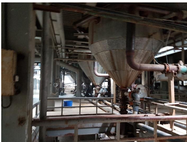
11. Sugar is produced inside the factory.