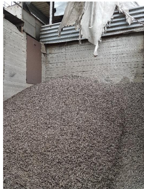
16. Release pile of SBPP.