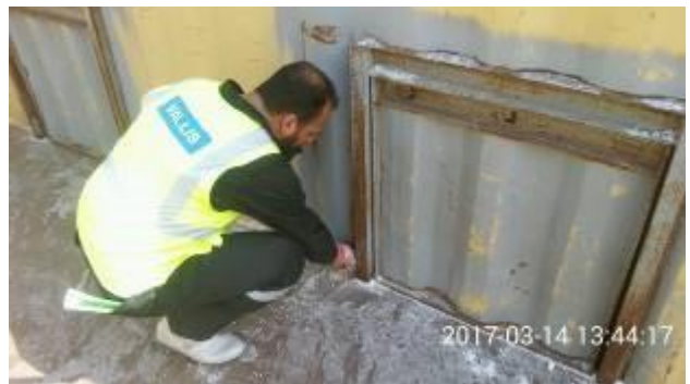
18. Vallis staff inspect each truck for contaminants, previous cargo remnants or hidden weights.