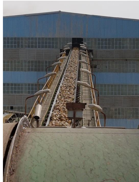
10. Clean Sugar Beets enter factory for sugar extraction.