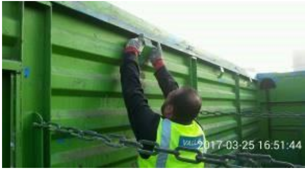
19. Vallis staff inspect each truck for contaminants, previous cargo remnants or hidden weights.