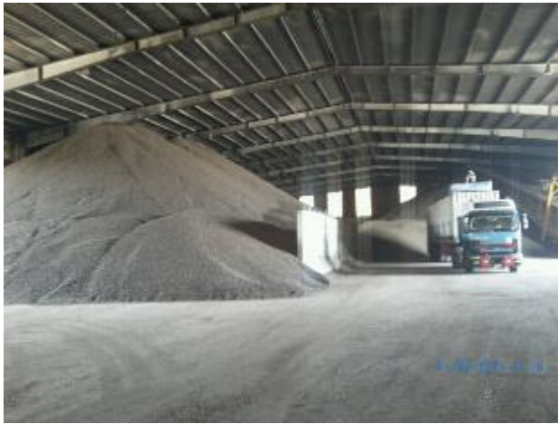
37. Vallis ensure proper segregation of bulk SBPP in the warehouse.