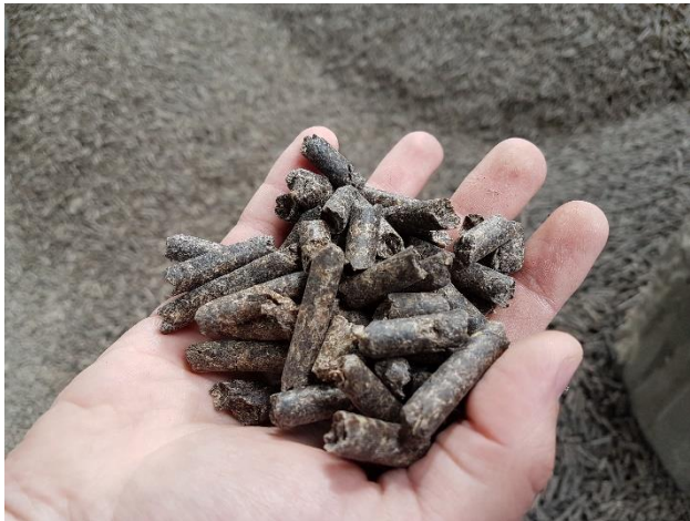
15. Sugar beet pulp pellets (SBPP) in their final form