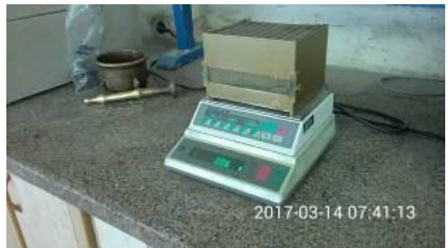
28. Scales, Moisture and Protein measurement device.