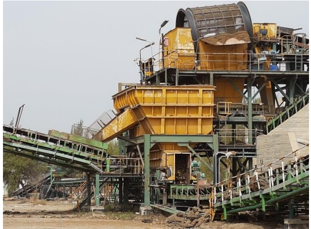
4. First tumbler to separate earth from the beets and channel beets to the storage pile or into factory.