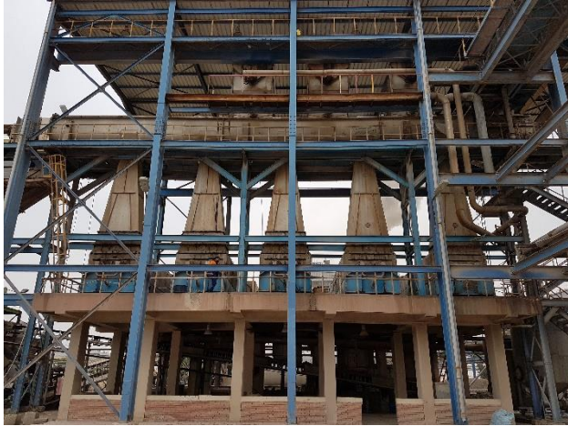
13. Driers reduce the moisture in pulp to appropriate levels.