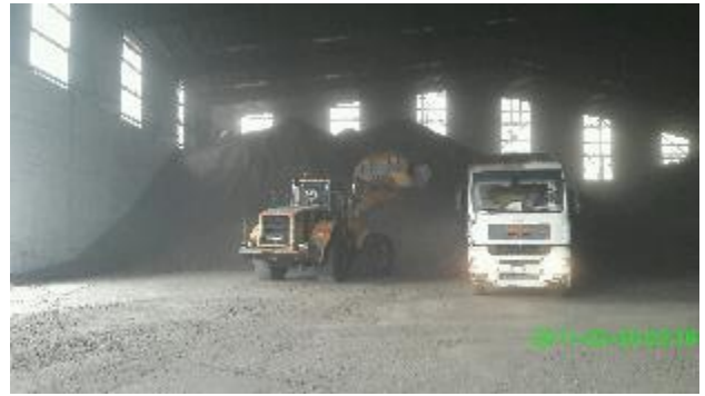
38. Vallis oversee release of SBPP from the warehouse to the vessel.