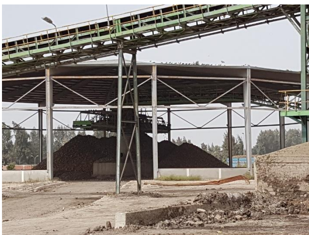
5. The storage pile.