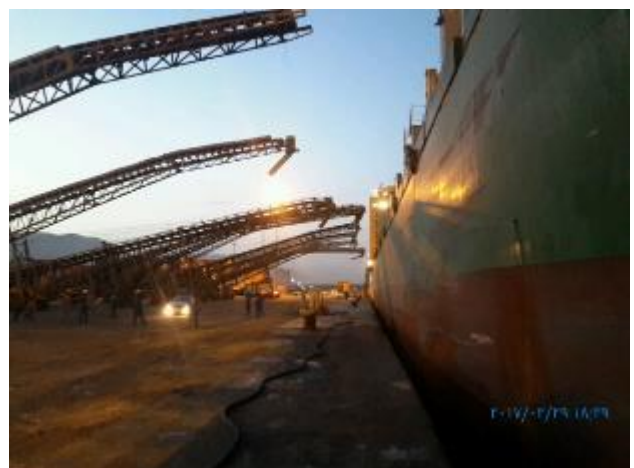
36. Vallis survey, inspect and fumigate the vessel at the port.