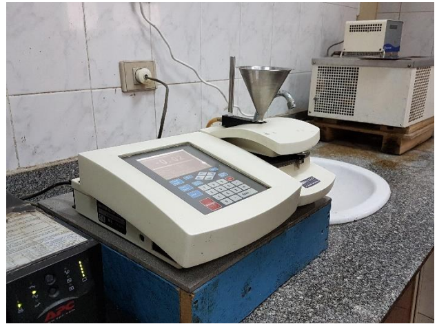
26. Moisture detector.