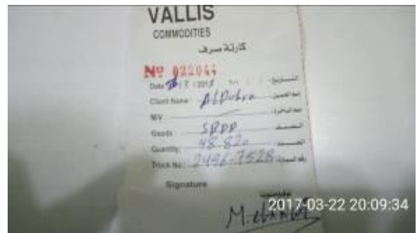
30. Vallis General Release Note in English and local language.