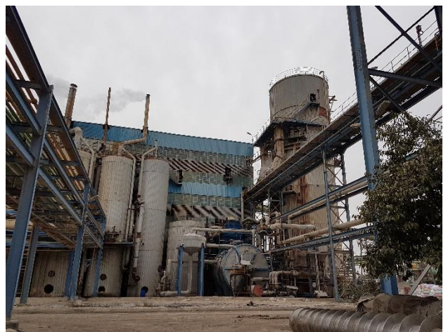
12. Sugar beet pulp is transported through pipes from the sugar factory for final stages of processing.