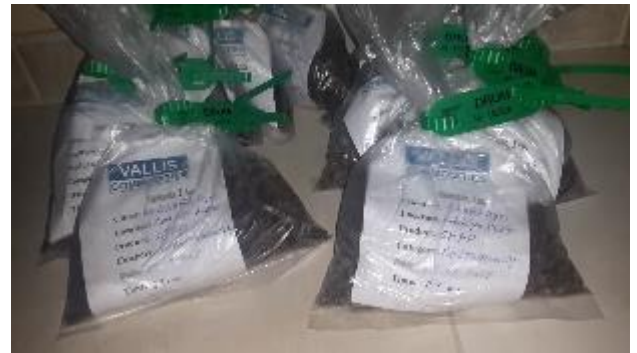
40. Vallis test and retain samples through-out the process.