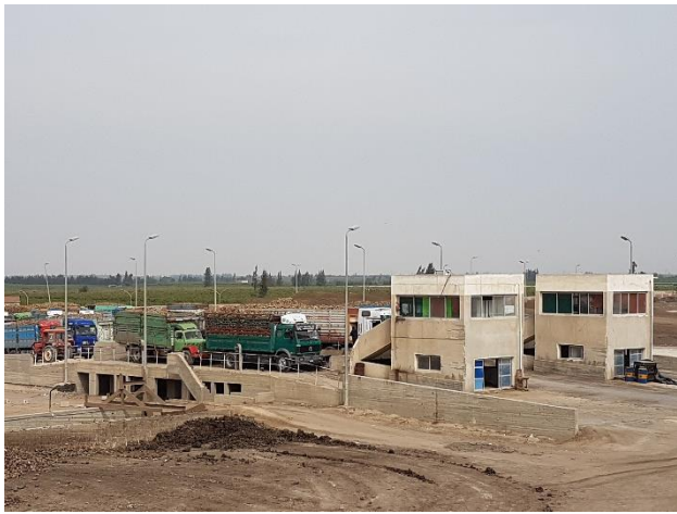
1. Sugar beet loaded trucks queue for receipt into factory conveyor system.