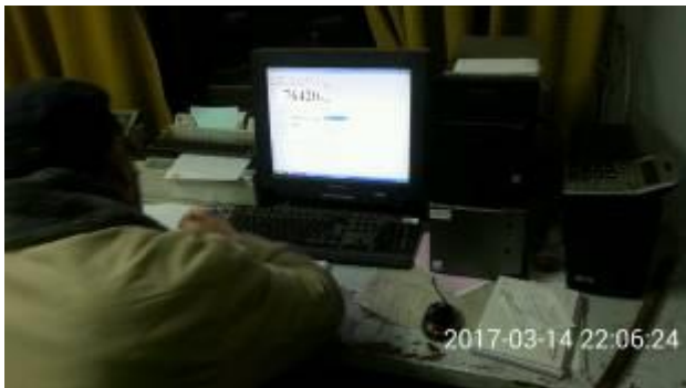
29. 24hr operations inside the weight bridge.