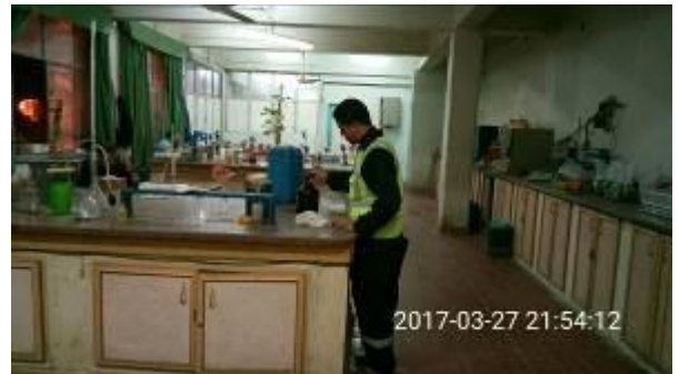
22. Vallis staff with samples at on-site testing lab.