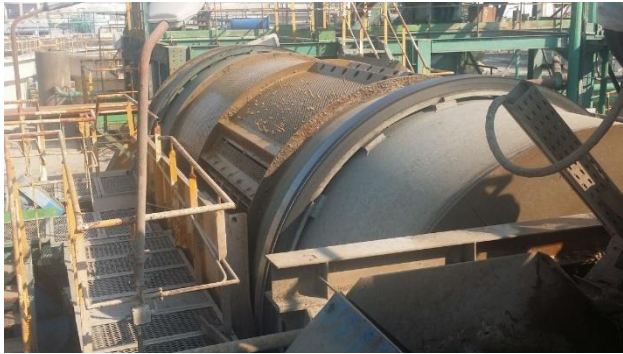
9. Second washing drum.