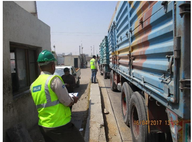
32. Vallis staff running 24hr operations at the port warehousing for receipt of SBPP from the factory.