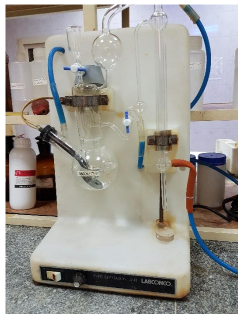
24. Titration Apparatus for protein measurement.