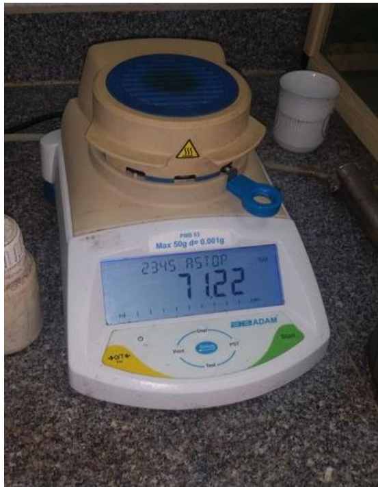
23. SBPP scale, moisture and protein checker.