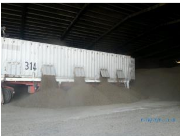
35. Trucks unload under Vallis supervision.