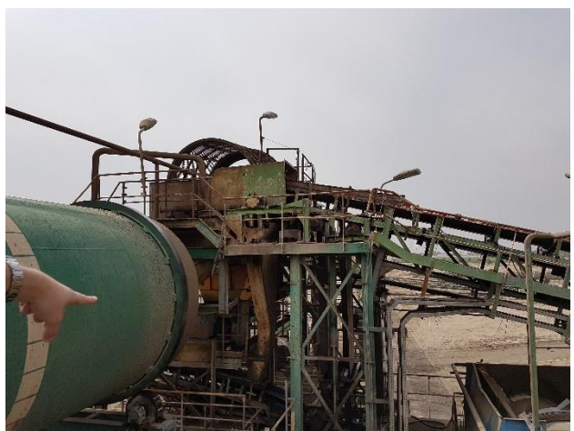
6. Beets travel up the conveyor into a second tumbler and then into the first of 3 washing drums.