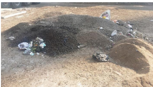
17. Example of burnt and rejected SBPP, resulting from overheating in the Heat Compressors.