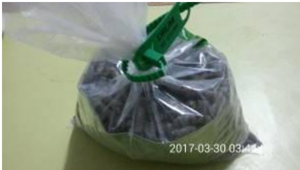
27. Vallis SBPP sample sealed and held for retention.