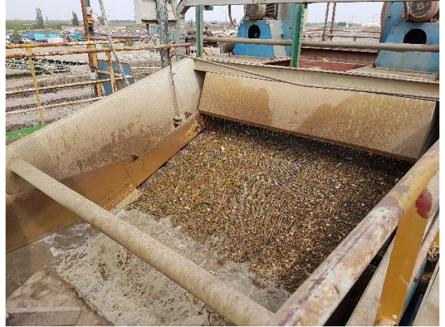
8. Impurities removed from washing phase.