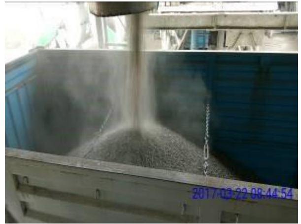
20. SBPP release directly into trucks.