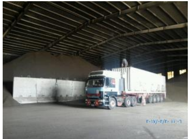
34. Vallis staff oversee unloading of trucks from the factory at the port warehouses.