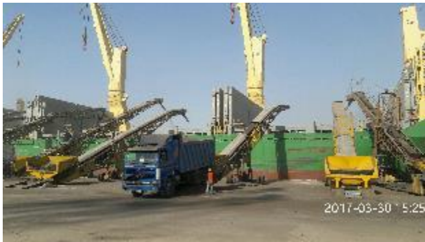
39. Vallis staff on-hand, ensuring proper loading of the vessel into correct holds.