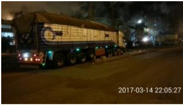
31. Trucks enter weighbridges under Vallis supervision and inspection.