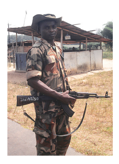
AN ECOMOG SOILDER IN LIBERIA