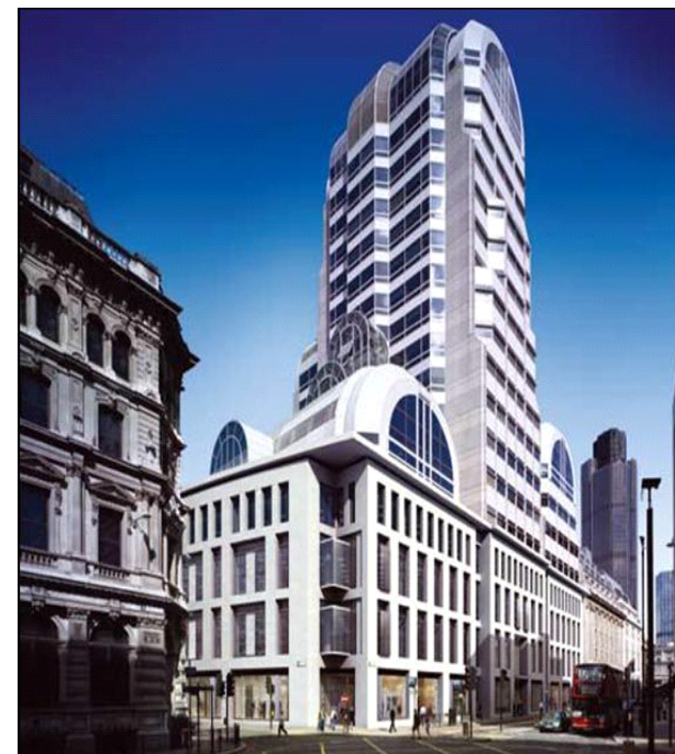
RFIB Group Ltd, 20 Gracechurch Street, London